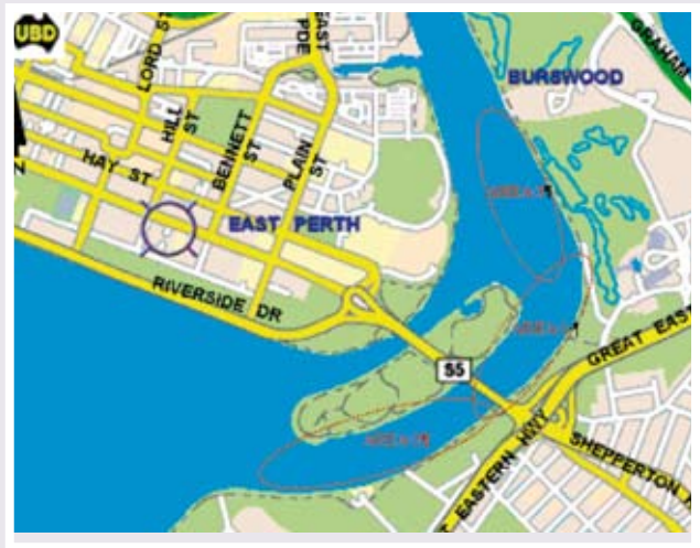
Representative Map Showing Areas 1, 2 & 3